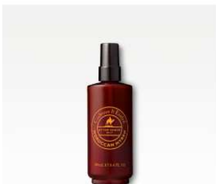
Moroccan Myrrh Moroccan Myrrh Aftershave Balm

COLLECTION FORMERLY KNOWN AS NOMAD ® ~ SAME FRAGRANCE. NEW NAME.