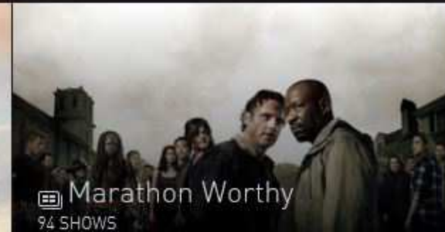
Marathon Worthy 94 SHOWS