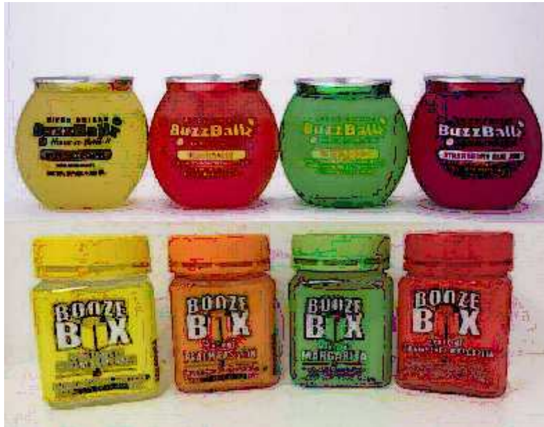
Pl.'s Fig. 1.

A side by side comparison is shown below: