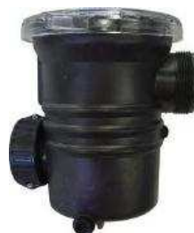
Filter Parts (48)

We carry a complete line of replacement parts for your above-ground pool!