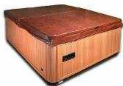
Spa Covers (1)

We've got a cover for virtually every spa! Over 1,000 different patterns for most manufacturers or custom made to fit your spas.