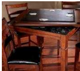
Game Room Furniture, Tables & Supplies (50)

America's top brands, styles, and designs! We've got a pool table for you!