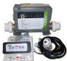
Spa Parts (107)

Choose from our wide selection of spa sanitizers & balancing chemicals, as well our popular Spa Frog mineral system!