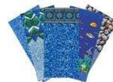
Replacement Pool Liners (88)

No matter your family size, your backyard size, or your budget, we've got a pool for you!