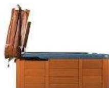
Pool and Spa Accessories & Equipment (67)

Rec Warehouse offers one of the largest selections of high quality replacement above ground pool liners!