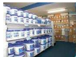
Spa Chemicals (23)

We've got a cover for virtually every spa! Over 1,000 different patterns for most manufacturers or custom made to fit your spas.