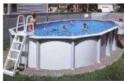
Swimming Pools and Packages (25)

Top quality Infrared Saunas available in 1, 2, 3, & 4 person models!