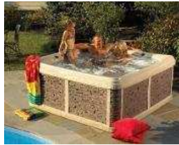
Spas & Hot Tubs (9)

We're your hot tub experts & we've got a spa for you! Choose from America's top brands & styles.