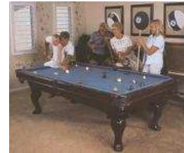
Pool Tables (8)

We're your hot tub experts & we've got a spa for you! Choose from America's top brands & styles.