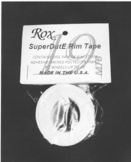
ROX SuperDutE 19 x MTB Rim Tape