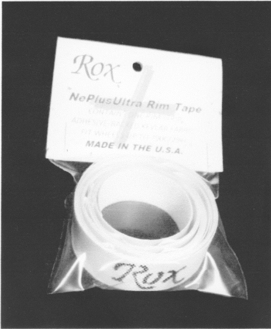
ROX NePlusUltra Rim Tape

Telephone and Fax: 520.615.0454 roxsince1987@hotmail.com