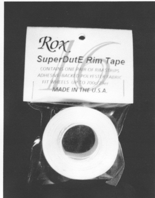
ROX SuperDutE 16 Rim Tape

EXHIBIT F WIT: Harris DATE: 11-19-12 COLLEEN KELLY, RPR