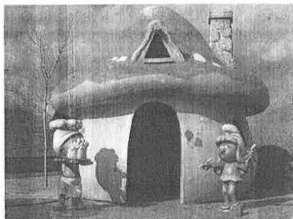
Representations of Smurfette and Greedy Smurf in an amusement park in Ankara.

In 1984, the Smurfs began appearing in North American theme parks owned by Kings Entertainment Corporation . Each park featured a Smurf attraction and Smurf walk-around figures. Canada's Wonderland had an entire Smurf village to walk through, ending with Gargamel's Castle . " The Smurfs' Enchanted Voyage " was located in Kings Island . Kings Dominion has " Smurf Mountain ". California's Great America featured a pint-sized steel coaster, " The Blue Streak ". Carowinds had an artificial island that was named Smurf Island that had a Smurf village—including toadstool houses which could be entered. Hanna-Barbera Land had a Smurf district.