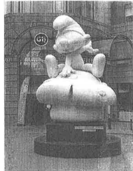
Smurf statue in Brussels (at Galerie Horta)