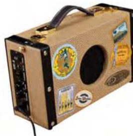
Ukulele Suitcase 5 Watt Amp $99.00+ FREE SHIPPING (U.S. Only - lower 48)