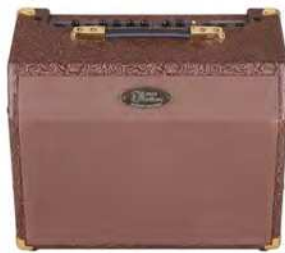
Acoustic Ambience 25 Watt Amp $149.00+ FREE SHIPPING (U.S. Only - lower 48)