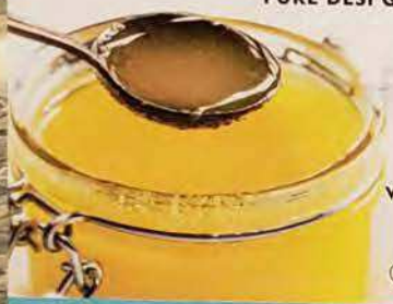
PURE DESI GHEE