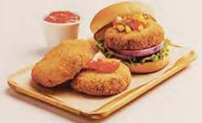
VEGGIE BURGER PATTIES