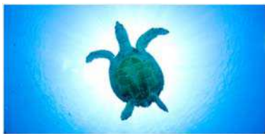
SEA TURTLE SKYPANELS $99.95 $39.97 ★★★★★ 16 Reviews