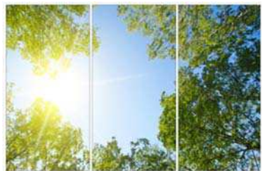
MORNING RAY MULTI SKYPANELS $179.99 $119.91 ★★★★★ 4 Reviews