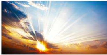
SUNSET SKYPANELS $99.95 $39.97 ★★★★★ 19 Reviews