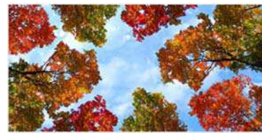
FALL TREES SKYPANELS $99.95 $39.97 ★★★★★ 16 Reviews