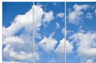
SCATTERED CLOUDS MULTI SKYPANELS $179.99 $119.91 ★★★★★ 15 Reviews