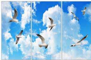
FLOCK OF SEAGULLS MULTI SKYPANELS $179.99 $119.91 ★★★★★ 2 Reviews