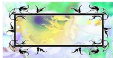
MORNING BLOOM SKYPANELS $59.99 $39.97 ★★★★★ 2 Reviews