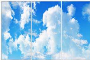
RADIANT SKIES MULTI SKYPANELS $179.99 $119.91 ★★★★★ 3 Reviews