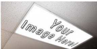
CREATE SKYPANEL $99.95 $64.97 ★★★★★ 22 Reviews