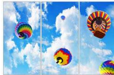
HIGH FLYING BALLOONS MULTI SKYPANELS $179.99 $119.91 ★★★★★ 2 Reviews