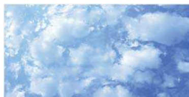
STRATUS CLOUDS SKYPANELS $59.99 $39.97 ★★★★★ 16 Reviews