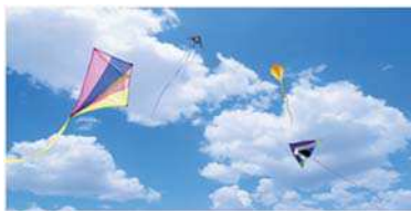
KITE SKYPANELS $59.99 $39.97 ★★★★★ 21 Reviews