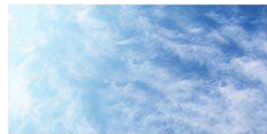
CIRRUS CLOUDS SKYPANELS $59.99 $39.97 ★★★★★ 23 Reviews