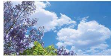
JACARANDA TREE SKYPANELS $59.99 $39.97 ★★★★★ 38 Reviews