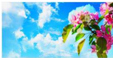
BLOSSOM SKYPANELS $59.99 $39.97 ★★★★★ 5 Reviews