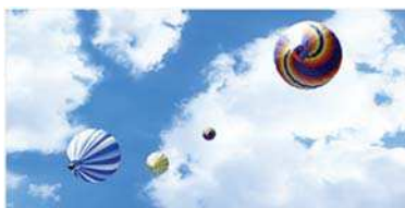
HOT AIR BALLOONS SKYPANELS $59.99 $39.97 ★★★★★ 17 Reviews