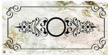
AUSTERE MARBLE SKYPANELS $59.99 $39.97 ★★★★★ 23 Reviews