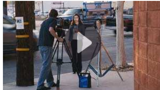
SkyPanel Features film

Incorporating features of ARRI's successful L-Series LED Fresnels, SkyPanel is one of the most versatile soft lights on the market, as well as one of the brightest. Like the L-Series, SkyPanel 'C' (Color) versions are fully tuneable; correlated color temperature is adjustable between 2,800 K and 10,000 K, with excellent color rendition over the entire range. Full plus and minus green correction can be achieved with the simple turn of a knob, and in addition to CCT control, vivid color selection and saturation adjustment is also possible. The remote phosphor versions of SkyPanel are roughly 10% brighter than the color versions and have a lower price point. Different color temperature panels are available, including 2,700 K; 3,200 K; 4,300 K; 5,600 K; 6,500 K and 10,000 K. A chroma green phosphor panel is available for green screen lighting.