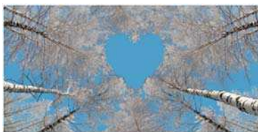
FOREST LOVE SKYPANELS $99.95 $39.97 ★★★★★ 6 Reviews