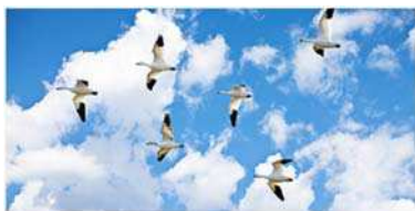
BIRDS SKYPANELS $99.95 $39.97 ★★★★★ 15 Reviews