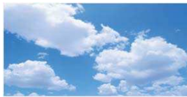
CUMULUS II SKYPANELS $59.99 $39.97 ★★★★★ 164 Reviews