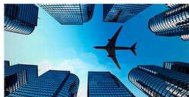
CITY LIGHTS SKYPANELS $99.95 $39.97 ★★★★★ 5 Reviews