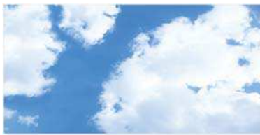
CUMULUS I SKYPANELS $59.99 $39.97 ★★★★★ 69 Reviews

Decorative light diffusers are the smartest, most cost effective, aesthetically pleasing, and creative solutions for significantly enhancing the quality of lighting in all kinds of spaces. These decorative light diffuser panels can be fit over all kinds of LED and fluorescent lighting fixtures. Apart from cutting the glare, these diffusers simulate natural ambient lighting, as well as spread fluorescent and LED lighting evenly across the ceiling and the room where they're installed. With our range of classic, multi, and custom skypanels, you can transform the look and feel of your offices, homes, kitchens, and bathrooms into something better. Explore the range of fabulous scenery we have on the menu, specify your custom requirements, and talk to our experts to understand more on how our skypanels can make a difference in your offices and homes.