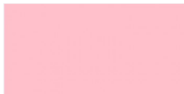
SKYPANEL MULTI-COLOR PINK $59.99 $35.00