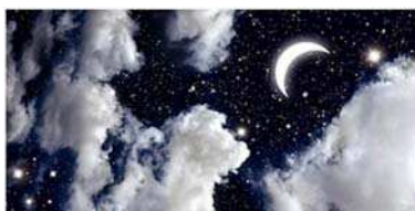
SUMMER NIGHTS SKYPANELS $99.95 $39.97 ★★★★★ 14 Reviews