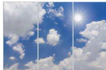
BRIGHT SUN MULTI SKYPANELS $179.99 $119.91 ★★★★★ 8 Reviews