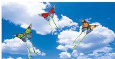
BUTTERFLY KITES SKYPANELS $59.99 $39.97 ★★★★★ 26 Reviews