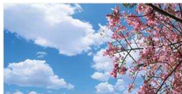
PINK TREE SKYPANELS $59.99 $39.97 ★★★★★ 44 Reviews