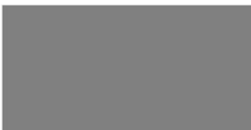
SKYPANEL MULTI-COLOR GRAY $59.99 $35.00 ★★★★★ 2 Reviews