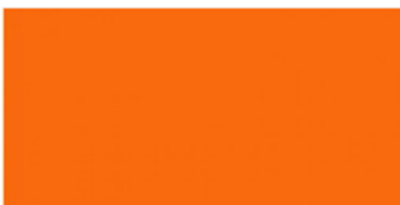
SKYPANEL MULTI-COLOR ORANGE $59.99 $35.00