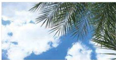
PALM TREE SKYPANELS $59.99 $39.97 ★★★★★ 43 Reviews