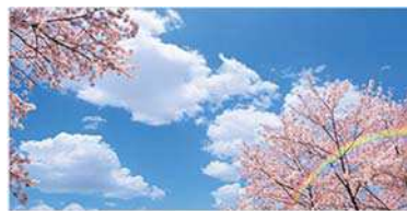
SPRINGTIME BLISS SKYPANELS $99.95 $39.97 ★★★★★ 30 Reviews