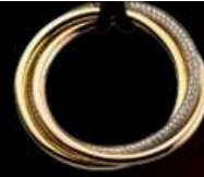
TRINITY DE CARTIER NECKLACES