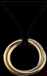
TRINITY DE CARTIER NECKLACES