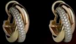
TRINITY DE CARTIER EARRINGS