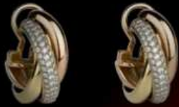
TRINITY DE CARTIER EARRINGS