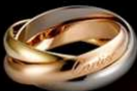
TRINITY DE CARTIER RINGS