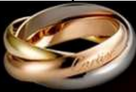
TRINITY DE CARTIER RINGS