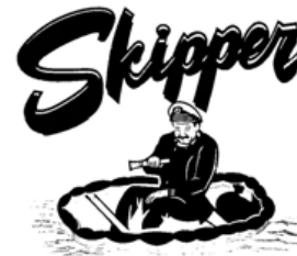
Applicant's Alleged Mark