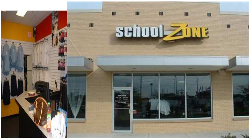
Exhibit A Photos of one of Opposer's Retail Stores