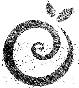
Pinkberry Mark (Serial No. 78/876,477)