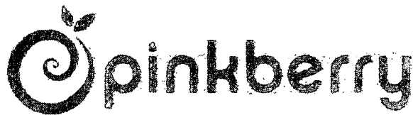
Pinkberry Mark (Serial No. 78/876,477)

The following details of comparison show contrasts.