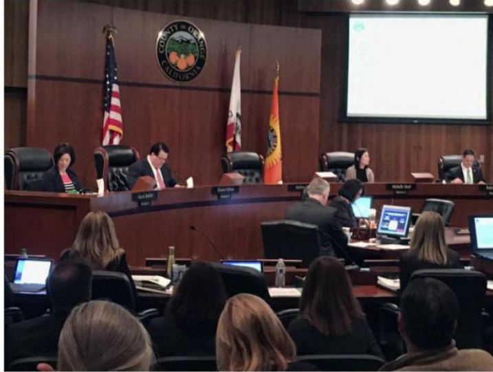
The Orange County Board of Supervisors during a meeting in Santa Ana, Calif., on Tuesday. The board voted to oppose California's sanctuary law for undocumented immigrants.

Still further, the proposed mark is shown on a map for the Orange County (OC) Civic Center, which depicts the name, address and location of various government facilities by color: Applicant facilities in orange, city facilities in green, state facilities in blue, and federal facilities in black. 49 The County of Orange facilities indicated on this map reflect functions that are traditionally and uniquely provided by a government: the district attorney's office, the health care agency and vital records office, the law library, the men's and women's jail, the coroner's office, the Old County