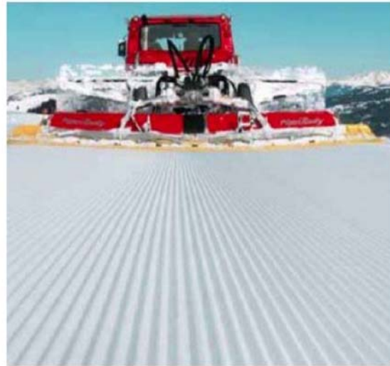
PistenBully’s Groomed Snow Design