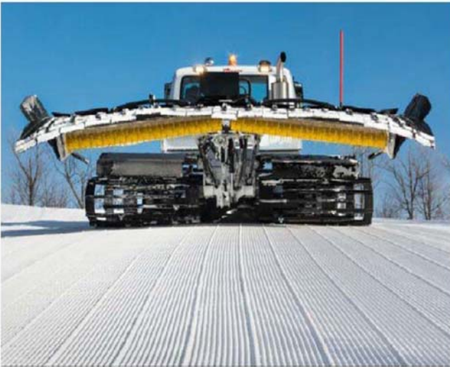
Applicant’s Trade Dress

Applicant is not claiming rights in the corduroy design per se; rather Applicant is seeking to register a corduroy design consisting of a repeating pattern of ten substantially equidistant grooves that each have a substantially pointed bottom, the ten substantially equidistant grooves being offset on both sides by a thicker groove having a substantially flat bottom. In its November 6, 2014 Response to an Office Action, Applicant presented a side-by-side comparison of Applicant’s snow pattern and the snow pattern created by PistenBully, a competitor, thus, distinguishing Applicant’s purported mark from other snow tracks. 11 The comparison is reproduced below: