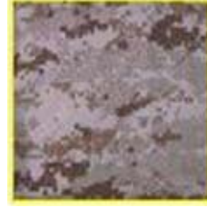
ACU - Army Combat Uniform -jacket