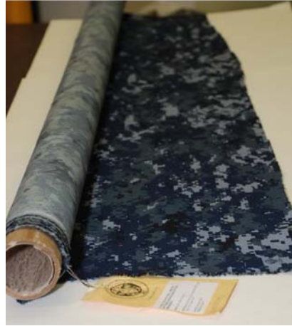
Fabric bolt 25

Applicant has persuasively shown there are many alternative "camouflage" patterns that are different from applicant's pattern but, due to their coloration and pattern, could similarly mask stains and hide wear and tear. 26 We therefore conclude that the availability of alternative designs that appear to work "equally well," does not support the examining attorneys' argument that applicant's marks are functional. Put another way, because there are alternative color pattern designs that perform the same functions as well as applicant's pattern, there is