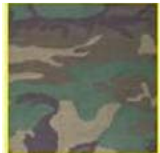
Coat, Hot weather, Camouflage