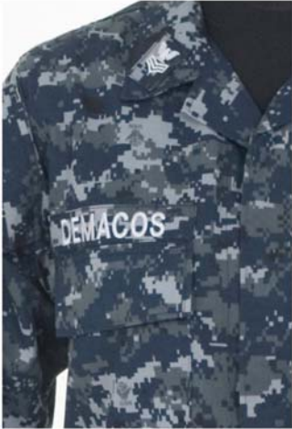
Uniform blouse 24