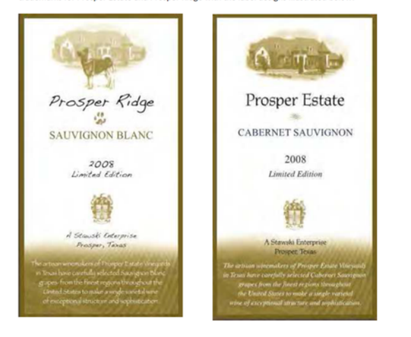
PEV will introduce direct wine sales once the vineyards vines achieve maturity (10+ years) by establishing an onsite winery and wine production facility. PEV will make the decision on mass marketing based upon yearly analysis of vine maturity. Until such time, PEV began actively test marketing both the Prosper Ridge and Prosper Estate brands in order to establish brand recognition for when the vines do reach maturity. PEV will apply for trademarks for Prosper Estate and Prosper Ridge with the label designs illustrated below.

Applicant's intermediate-term goals (years 4-7) included solidifying long-term sales contracts with his target market for 100% of his vineyard production; and his long-term goals (years 8+) included: