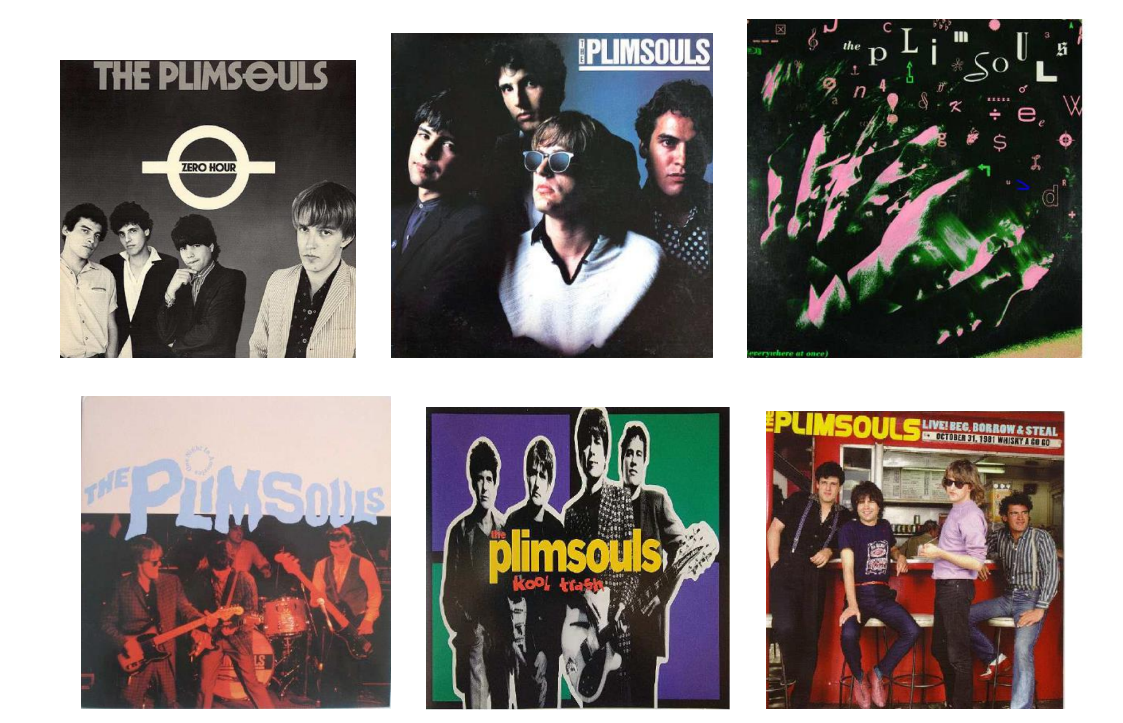
Id. at 37-39, 133, 146, 148, 166, 193, 200 (Case SJ Dec. ¶¶ 6, 12 and Paparella SJ Dec. Exs. D, F, G, K, X, Z); 43 TTABVUE 23 (Case Reb. Dec. ¶ 9); 43 TTABVUE 26 (Ramirez Reb. Dec. ¶ 4).

band in 1983,<sup>6</sup> he and the band's other members "have received royalties on the sales or streams of the Plimsouls' recordings from their creation through today," and with one exception, "every Plimsouls release has featured all four original members, including in cover photographs," as shown below: