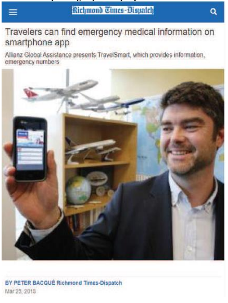
Id. at 89.14 The same photograph also appears next to the March 25, 2013 press release on the website of cision.com. Id. at 91-92.

• A March 23, 2013 article from the RICHMOND TIMES-DISPATCH entitled Travelers can find emergency information on smartphone app , which states that "Allianz Global Assistance has launched a smartphone app that provides travelers with emergency medical expertise," and that the "company's TravelSmart mobile app provides international and U.S. travelers with key information on local medical providers, translations of drug and first-aid terms, and emergency phone numbers." Id. at 89-90. The article contains the photograph displayed below: