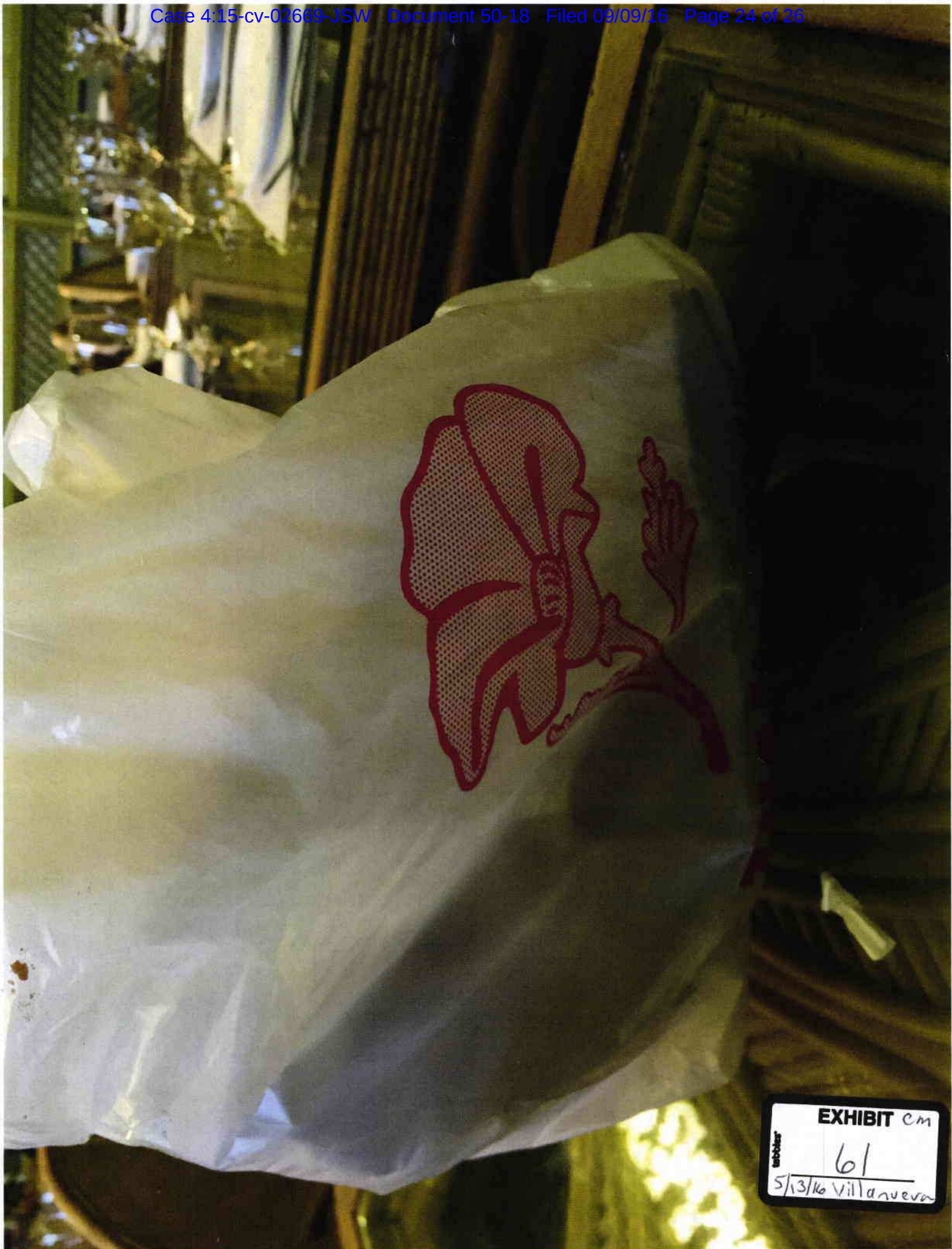
EXHIBIT cm 61 5/13/16 Villanueva