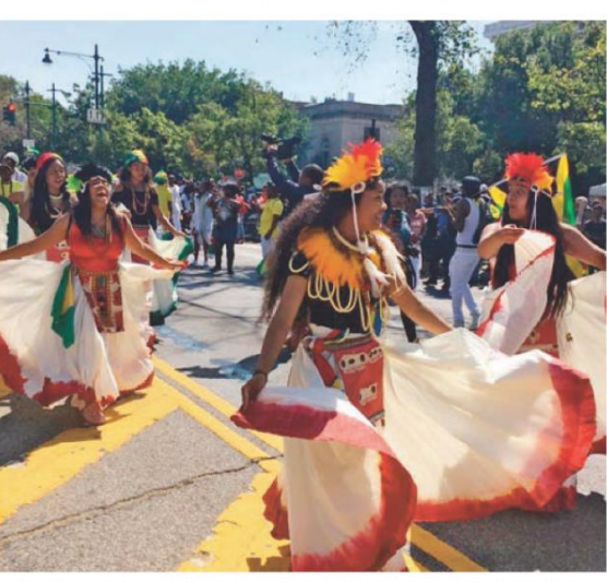
Members of the Impressions Dance Theater and GCA Summer Heritage Workshop Interns on Eastern Parkway, Labor Day 2017.

The art created by 9th season of SWS was also present at Family Fun Day and at the 50th anniversary celebrations of the West Indian Labor Day Celebrations on Brooklyn's Eastern Parkway.