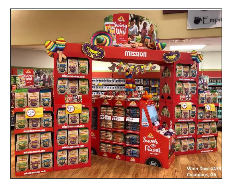
Id. at 40-50. This evidence establishes that MISSION is commercially strong. See e.g. Coach Services Inc. v. Triumph Learning LLC , 668 F.3d 1356, 101 USPQ2d 1713, 1720 (Fed. Cir. 2012) (commercial strength may be shown by "length of use of the mark, market share, brand awareness ..., and variety of goods bearing the mark").

There is no evidence that MISSION has any meaning in connection with tortillas or other flat bread products. We therefore find that the term MISSION is arbitrary (conceptually strong) when used in connection with tostadas, and also commercially strong.