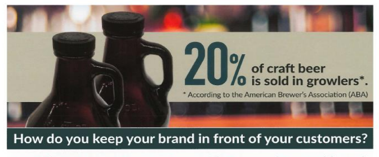
NNBC's Embossed Growler Caps with Taperseal Top & Side seal, your brew is kept fresher longer and your brand is promoted at the same time.

with the proposed mark DRINK MORE BEER appearing on the top cap, and one black cap resting on an angle by the middle cap, with the wording "YOUR LOGO HERE" and a seal and banner design. The wording "Cost-Effective Stock Designs 'Drink More Beer' – Stock print from $0.49 with no setup fees," "Custom Embossed Designs Custom caps with your logo starting at just $0.29/piece with a one-time setup fee of $3,500.00" appears next to the stack of caps. Applicant's logo "NNBC ESTD. 1916" and design appear in a vertical rectangular block on the lower left portion of the specimen, next to the wording "Contact NNBC's sales team to learn how our growler lid closures can help your brewery grow!" The brochure specimen appears as follows: