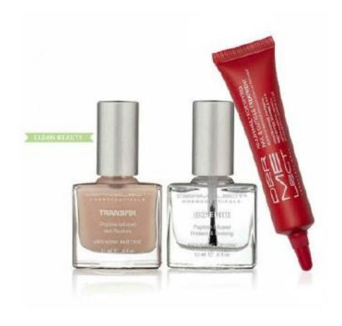
NATURAL NAIL REPAIR STRENGTHENING KIT for Gel & Acrylic Damaged Nails

The Examining Attorney also submitted two webpages showing services for care of gel nails which use the term GEL CARE: