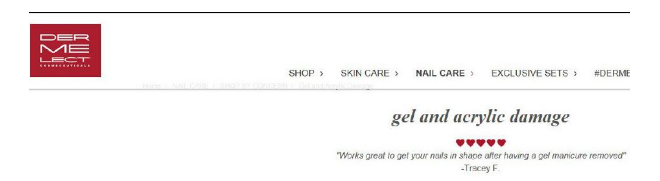
Figure 1 DermElect webpage9

Moreover, the Examining Attorney relied on a website showing repair of gels as a type of nail care: