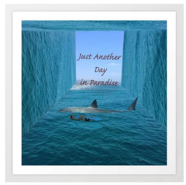
Another Day Paradise Pillow Cover Another Day Paradise Wide Tapestry $34.90 - $39.70