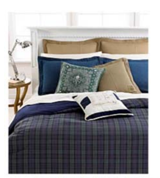
Lauren Ralph Lauren Blackwatch Lightweight Reversible Down Alternative Comforters