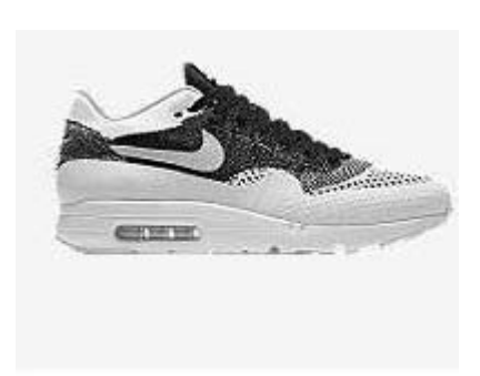
Customize Vike Air Max 1 Ultra Flyknit iD Shoe