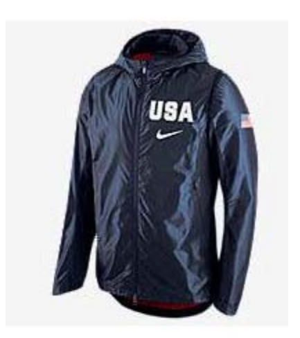
1 Color U SAB Nike Revolution Hooded Vien's Jacket