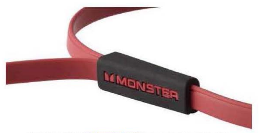
The revolutionary flat Monster cable means no cord tangles--ever

In Becton, Dickinson, the Federal Circuit considered advertising which promoted many features of the applicant's product but did not promote those features deemed inconsequential. The Court concluded, "[i]nstead the advertisements taken as a whole are more than substantial evidence that the proposed mark as a whole is functional." Becton, Dickinson, 102 USPQ2d at 1378. In the present case, Applicant's advertising addresses the configuration of the proposed mark, which depicts a headphone cable that is significantly wider than it is thick, and attributes to this shape the tangle-free nature of the headphone cable design. Although the advertising is silent about the contoured sides of the cable design, we find that Applicant's advertisements are substantial evidence that the proposed mark as a whole is functional and underscores the inconsequential nature of the contoured sides.