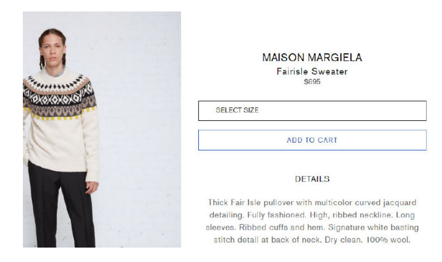
Figure 3 Fair Isle sweater<sup>7</sup>

In view of this record evidence, we find that as applied to the yarn featured in the cited registration, the mark FAIR ISLE is highly descriptive, and conceptually weak as applied to the registered goods. This DuPont factor weighs against finding a likelihood of confusion.